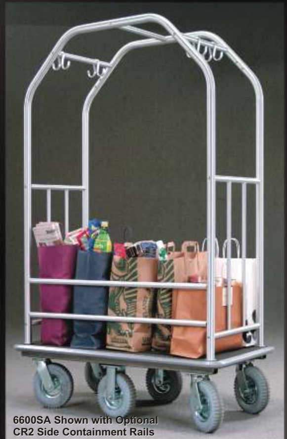
6600SA Shown with Optional CR2 Side Containment Rails